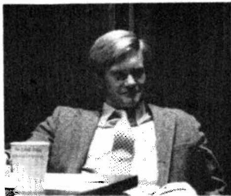
A clean-shaven Christopher Coons.

The point that others ignore is that I was ready to change. Experiences at Amherst my first two years made me skeptical and uncomfortable with Republicanism, enough so that I wanted to see the Third World for myself to get some perspective on my beliefs. Certainly Kenya provided a needed catalyst; I saw there poverty and oppression more naked than any in America, and I studied under a bright and eloquent Marxist professor at the University